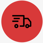
3/4 TON TRUCK